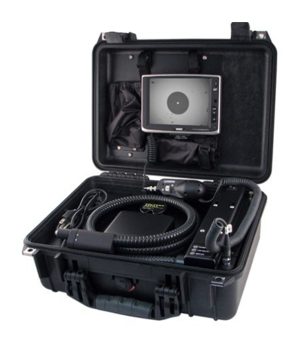
CleanBlast System—Portable with FBP Probe and 6.4-in LCD